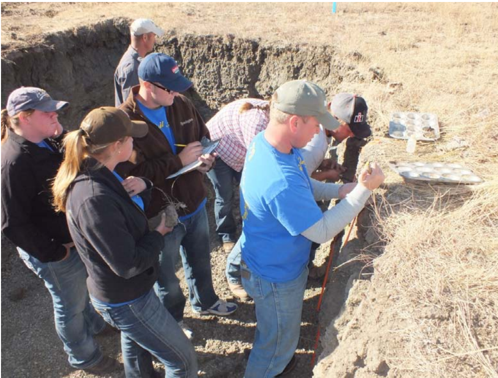
Hurley Soil Team Site with the SDSU team judging.