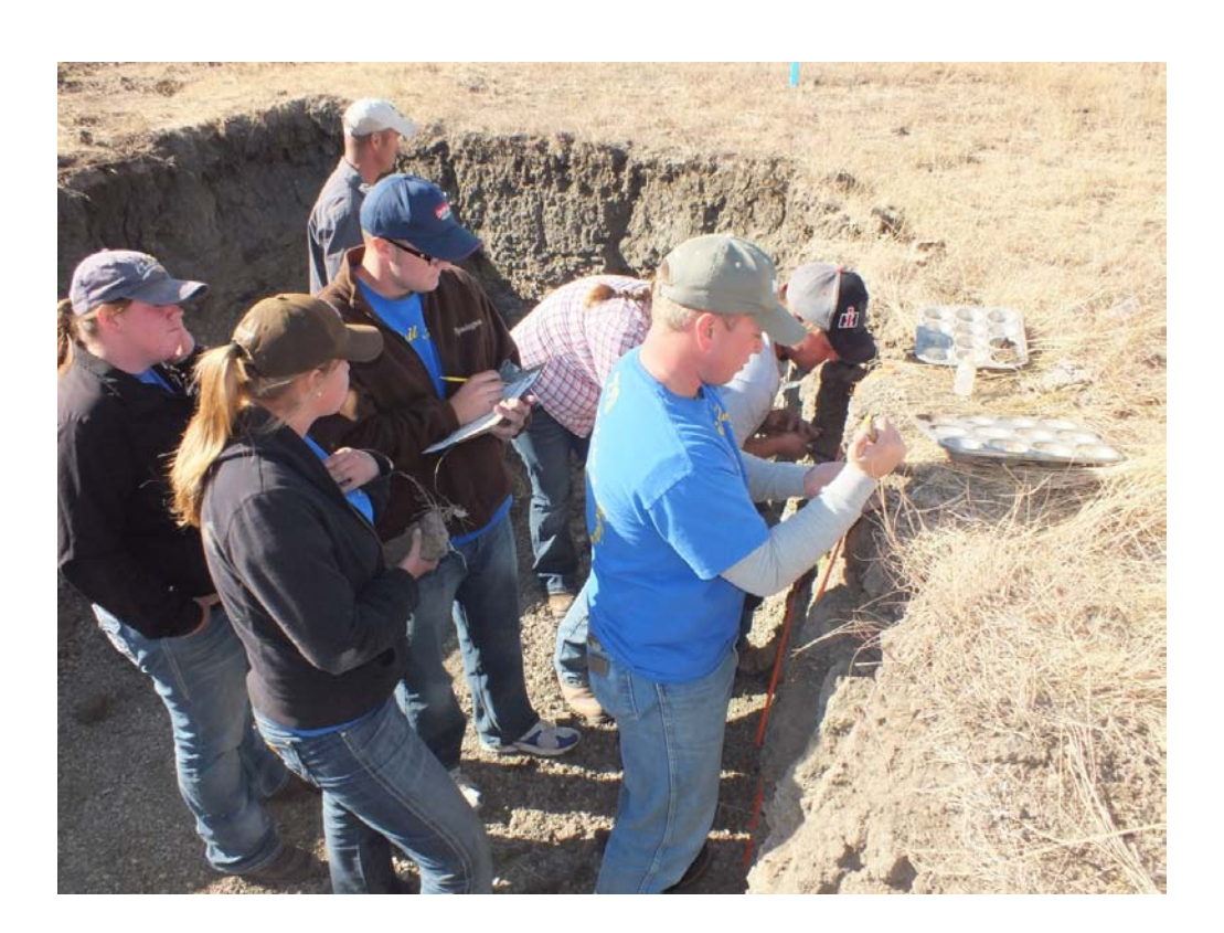
Hurley Soil Team Site with the SDSU team judging.